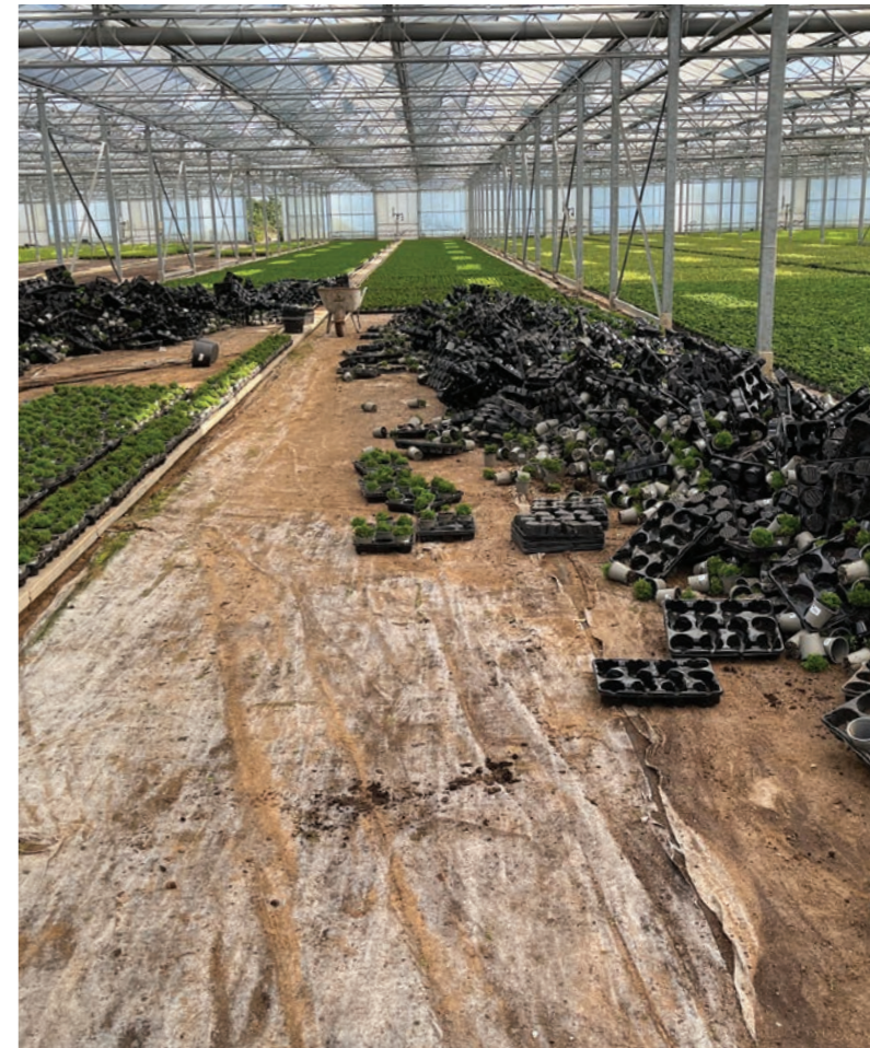
Damage to crops due to burst tank in the summer of 2022

The good news is that there are plenty of things that every user can do to ensure that his or her water silos are well protected. This not only prevents damage, but also extends their service life. This requires expert planning as well as an awareness of the fact that various risks are interrelated and may exacerbate each other. And that often very small, barely visible changes are the first signs that a tank is about to burst.