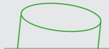
Discrepancy max. 5 %